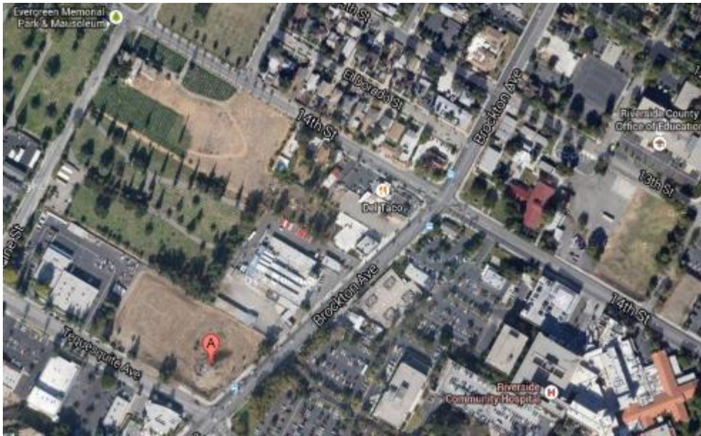
Site of Riverside Chinatown, second location.