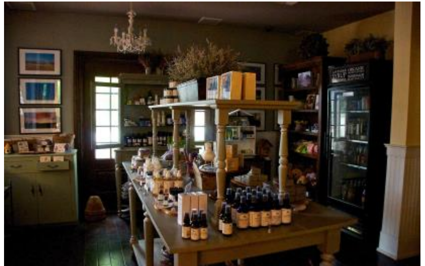
Below: Gift shop featuring lavender goods