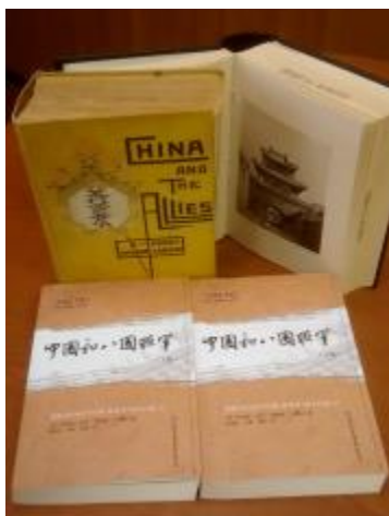
The original English work by Landor may be found in the Rivera Library at DS77LL26.