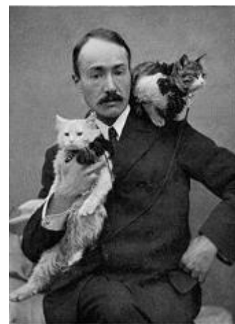
Arnold Henry Savage Landor with kittens Kerman and Zeris, whom he travelled with in Across Coveted Lands (1902)