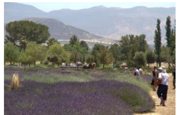
Hidden Gem, continued p.7

really felt as though we were a bit out in the middle of nowhere! Curious, we slowly wound our way through the pine trees along the driveway to the parking lot for the resort and were pleased by the lodge design of the main building. We were bundled in jackets and scarves and our breath made clouds in the cold air as we made our way inside. The white walls of the lobby were warmed by the contrast of wooden beams and seasonal decorations made by a local artist out of tumbleweeds, ribbon, and boughs of pine.