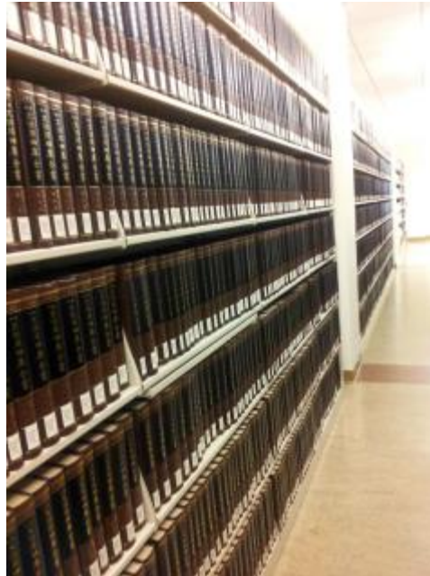
The 1501-volume collection, seen here in part, is located in the Rivera Library basement, under AC149.S699