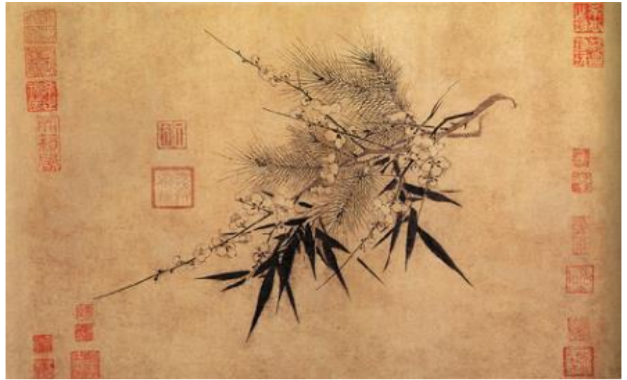
Zhao Mengjian (active ca. 1199-1264), Three Friends of Winter : Album leaf, ink on paper, national Palace Museum Taipei.