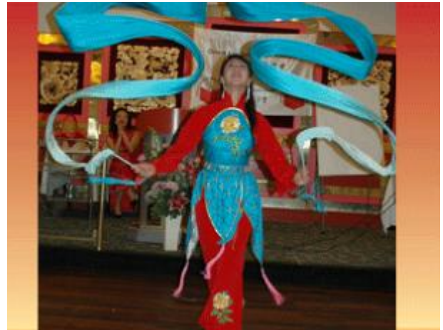
Previous CALA event featuring Chinese ribbon dance.