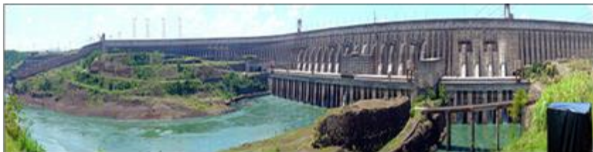
Itaipu Dam on the Parana River shared by Paraguay and Brazil

on campus about his research on the construction and development Itaipu Dam for hydroelectric power. His talk is entitled "Trans-nationalizing the Dam: the Unanticipated Consequences of the Itaipu Dam in the Making of the Upper Parana Region, 1957-1992. Everyone is welcome. It will be held on Wed. Feb. 11, Noon-1:15 pm, Tomas Rivera Library, Room 403. This event is sponsored by the University Library, the Latin American Studies Program, Chicano Student Programs and the Latin American Perspectives journal.