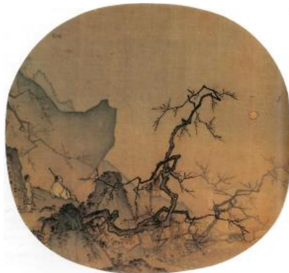
Above: Ma Yuan (active ca. 1190-1225), Viewing Plum Blossoms by Moonlight . Ink and color on silk fan, mounted as an album leaf, Metropolitan Museum of Art, New York.