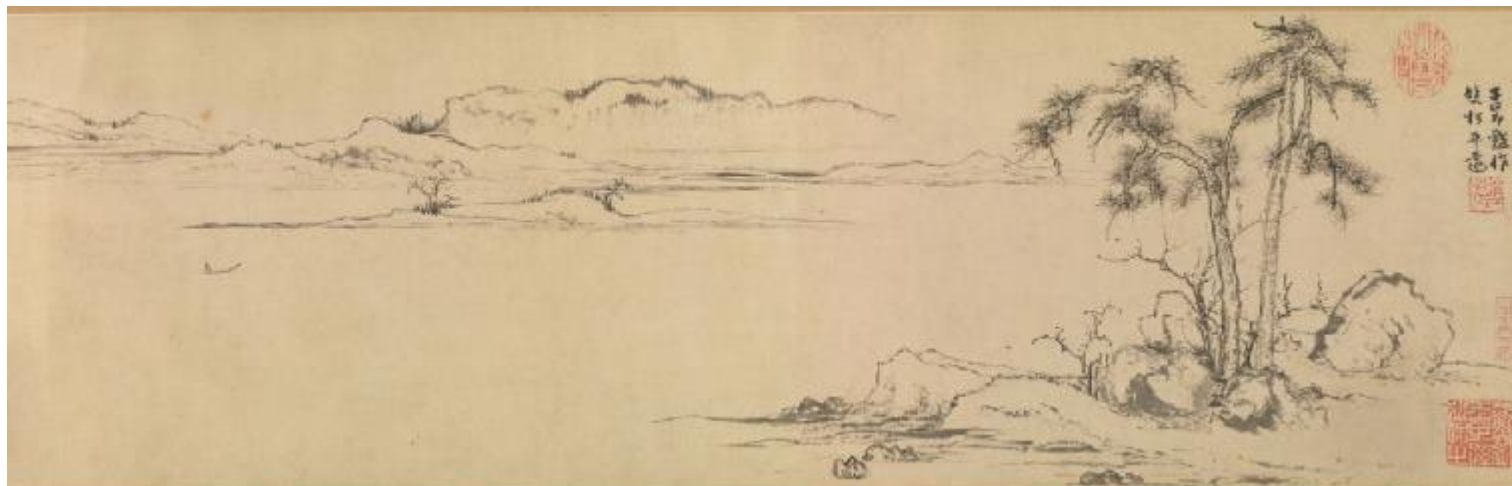
Zhao Mengfu (1254-1322), Twin Pines, Level Distance . Handscroll, ink on paper, Metropolitan Museum of Art, New York.

Our day-to-day work at the library doesn’t always feel like we are making any difference in the larger issues of our present time—equality, social justice, and civil rights. We must remember: our libraries are part of the fabric of our communities. Part of answering the trumpet call of conscience is the ever-present vigilance and belief that our work does make a difference. Our work matters. We matter.