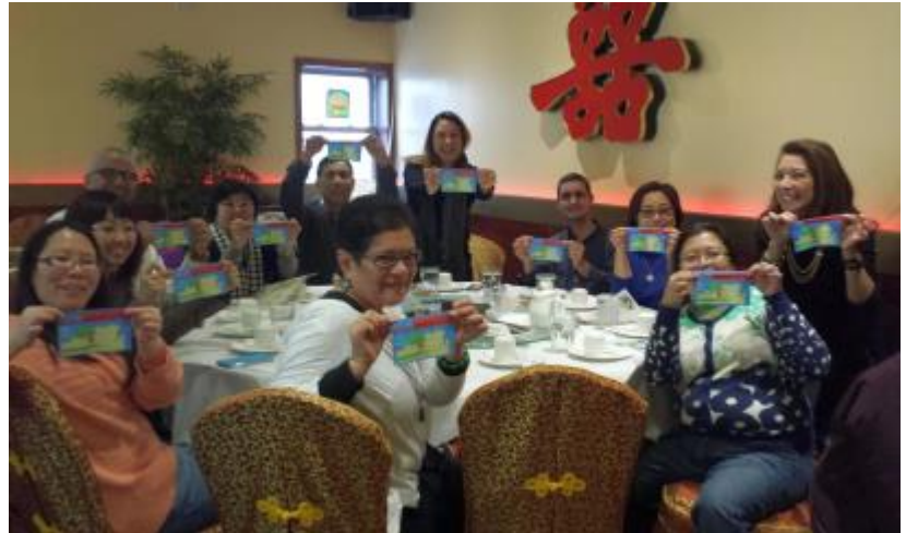
APALA members showing the APALA 35th Anniversary & Symposium cloth maps during the APALA ALAMW15 tour.

attend as many APALA events as possible. At ALA Midwinter 2015 (ALAMW15), APALA events included a visit to Chicago's Chinatown, particularly the Chinese-American Museum of Chicago and the Chinatown branch of the Chicago Public Library . First, our group had lunch at the Triple Crown Chinese Restaurant , where we had dim sum and great conversation. Among the things we talked about are the Conversation on Equity, Diversity, and Inclusion and the upcoming APALA 35th Anniversary & Symposium. To build up anticipation for the APALA event, I distributed microfiber cloth maps to the APALA ALAMW15 tour attendees (see picture). The cloth maps are limited release items that can only be obtained while supplies last.