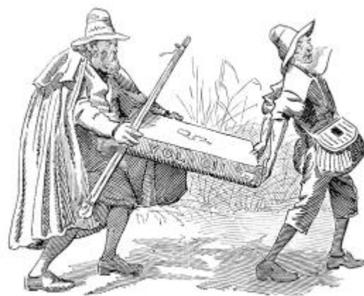
Shifting the oversize collection (artist’s rendering)

Orbach—Right now we are shifting on the 2nd floor in the QBs. This shift will continue backwards to the As. It should be completed by the end of winter quarter.