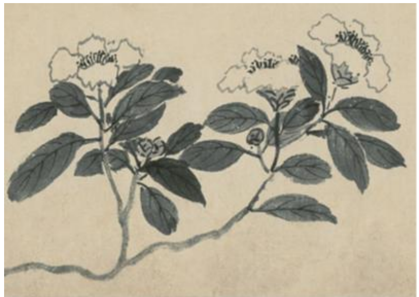
Shen Zhou (1427-1509), Eight Flowers in Ink (detail). Handscroll, ink on paper, private collection. To see full scroll: www.chinaonlinemuseum.com