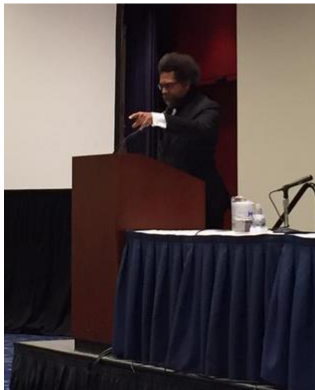
Dr. Cornel West, Keynote speaker at the Martin Luther King, Jr. Holiday Observance and Sunrise Celebration.

Heeding the continuing call to conscientious action, I attended the annual Martin Luther King, Jr. Holiday Observance and Sunrise Celebration event on Monday, February 2. It was my first time to attend the celebration. 2015 marked the 15th anniversary of the Martin Luther King Jr. Sunrise Celebration, making it even more special. Dr. Cornel West was invited as the keynote speaker at the event. As expected, he delivered a fiery, inspiring address that fanned the tiny flame in my heart and uplifted my flagging spirits.