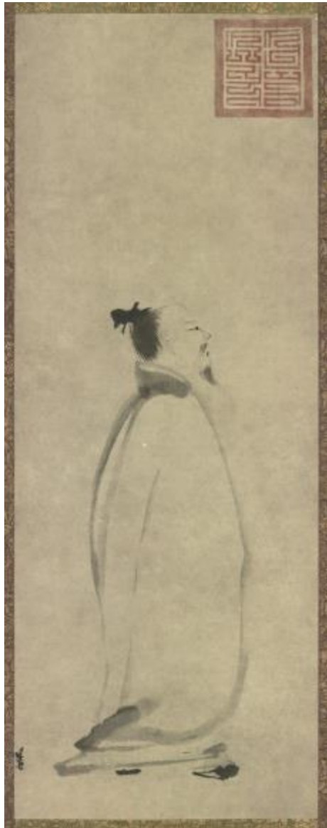
Liang Kai (ca. 1140-1210), Poet Li Bai , Hanging scroll, ink on paper, Tokyo National Museum.