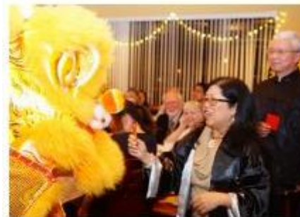
Above: Lion dancer Below: Guests at the banquet "feed" the lion by offering the hong bao , red envelopes of lucky money, to ensure good fortune for the New Year.